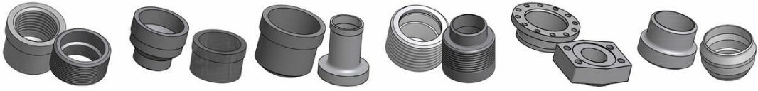
Threaded Connection Victaulic Connection Solder Connection Combo Connection Flange Connection Weld Connection