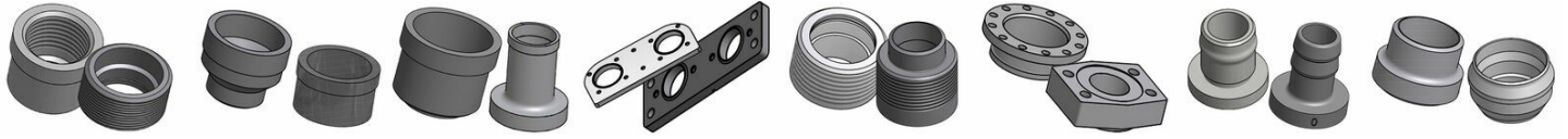
Threaded Connection Victaulic Connection Solder Connection Connection Plate Combo Connection Flange Connection Hose Connection Weld Connection