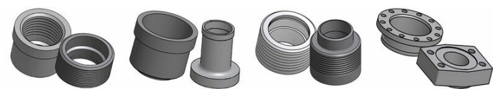
Threaded Connection Solder Connection Combo Connection Flange Connection

*For specific dimensions, or information about other types of connections, please contact your SWEP sales representative.