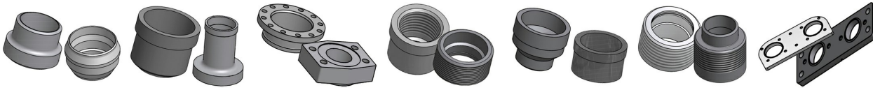
Weld Connection Solder Connection Flange Connection Threaded Connection Victaulic Connection Combo Connection Connection Plate

*For specific dimensions, or information about other types of connections, please contact your SWEP sales representative.