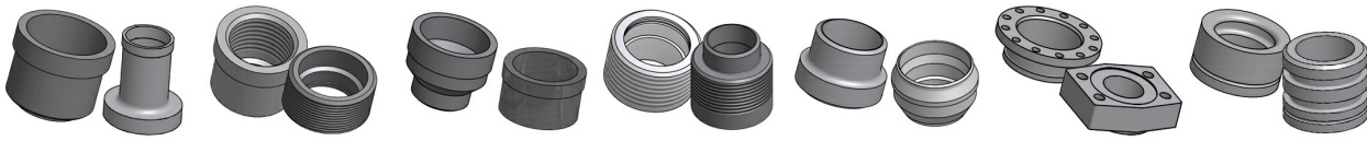
Solder Connection Threaded Connection Victaulic Connection Combo Connection Weld Connection Flange Connection O-Ring Connection

*For specific dimensions, or information about other types of connections, please contact your SWEP sales representative.